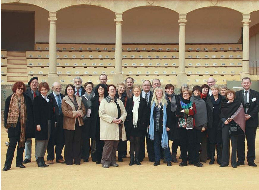
EUSTORY competition organisers at the General Assembly in Ronda, Spain