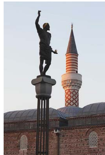
Dshumaja Mosque in Plovdiv

Financed by: Gerda Henkel Foundation, Germany GERDA HENKEL STIFTUNG